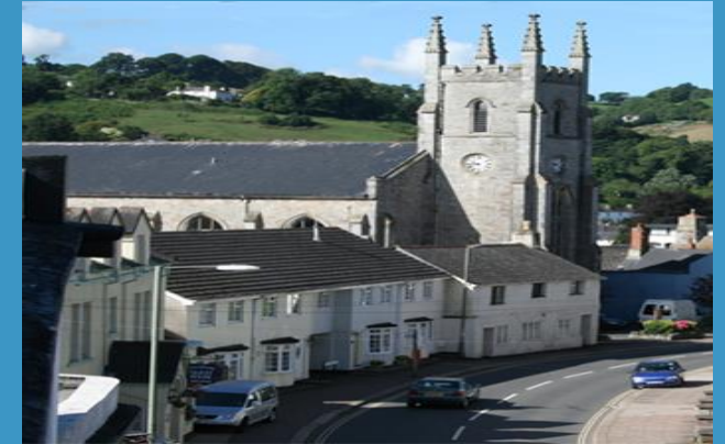
Solecco Solar Tiles