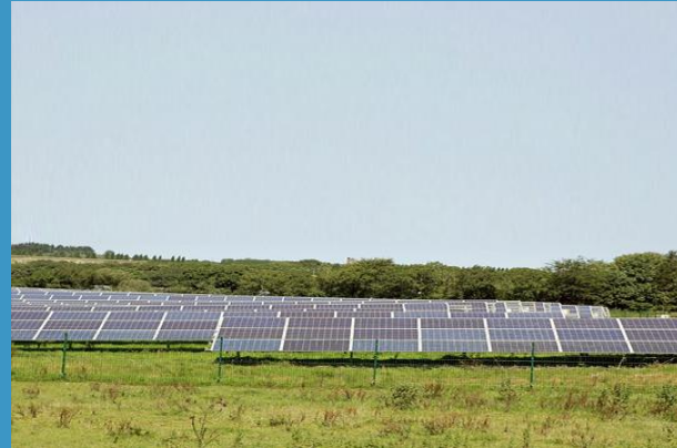
Ground Mount Solar Farms